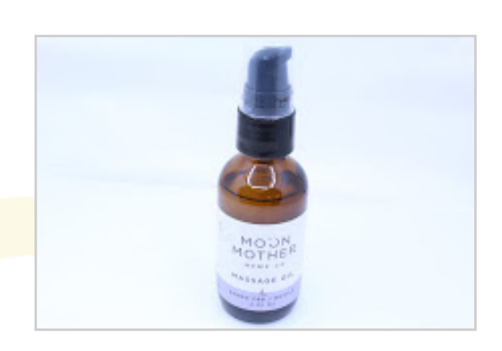
Unit: 2oz (53.22g) | Units Per Package:1

Analyzed via AAM-001 using Agilent 1220 HPLC-DAD. No Pass or Fail determination made. Please refer to any/all appropriate regulatory guidelines to determine if product tested is suitable for use. Deviations from SOP: None.