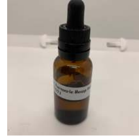
Cannabinoids (% weight)