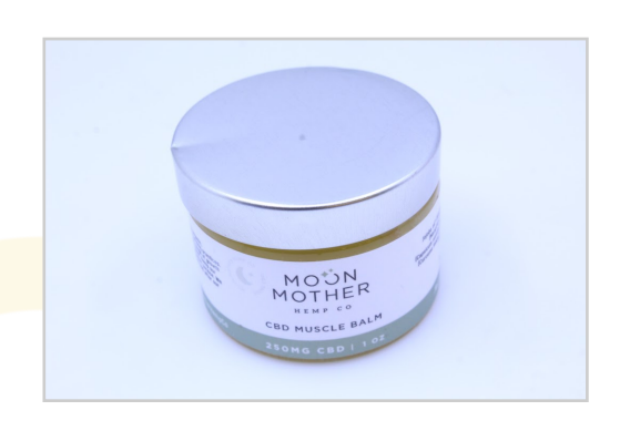
Unit: 1 oz (28g) | Units Per Package:1

Analyzed via AAM-001 using Agilent 1220 HPLC-DAD. Limits are based on CO 6 CCR 1010-21. Sample was analyzed as received. Deviations from SOP: None.